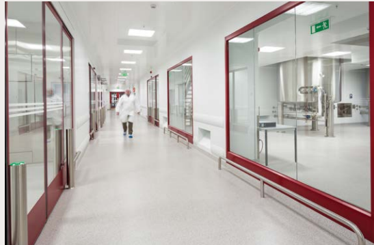
Sanofi (formerly Genzyme), Belgium Bulk Biologics Facility