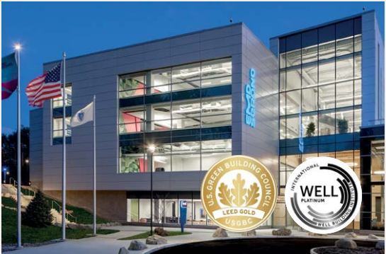
EMD Serono, USA R&D Laboratory and Office Facility