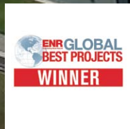
Janssen Sciences Ireland UC, Ireland Bulk Drug Substance Facility