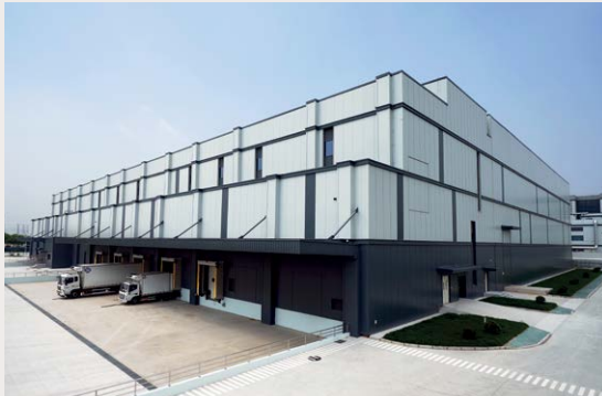
Merck, China OSD Manufacturing, Packaging and Logistics Facility