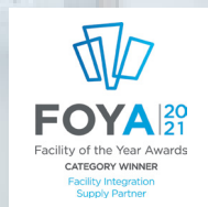
Takeda, Ireland High Containment API and DP Facility