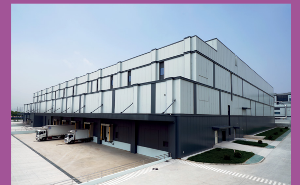
Merck, China OSD Manufacturing, Packaging and Logistics Facility