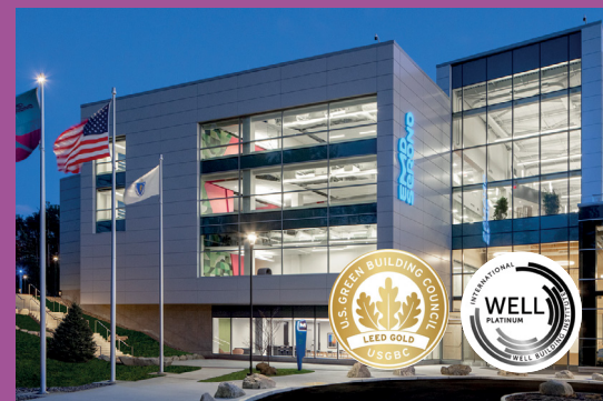
EMD Serono, USA R&D Laboratory and Office Facility