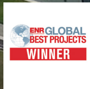
Janssen Sciences Ireland UC, Ireland Bulk Drug Substance Facility