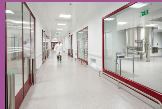
Sanofi (formerly Genzyme), Belgium Bulk Biologics Facility